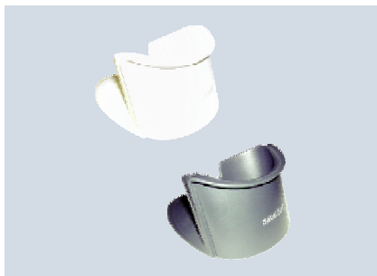
Gryphon™ Desk / Wall holders