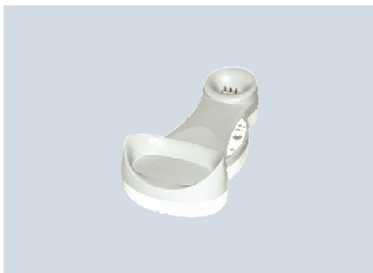
OM - Gryphon™ / C-Gryphon™